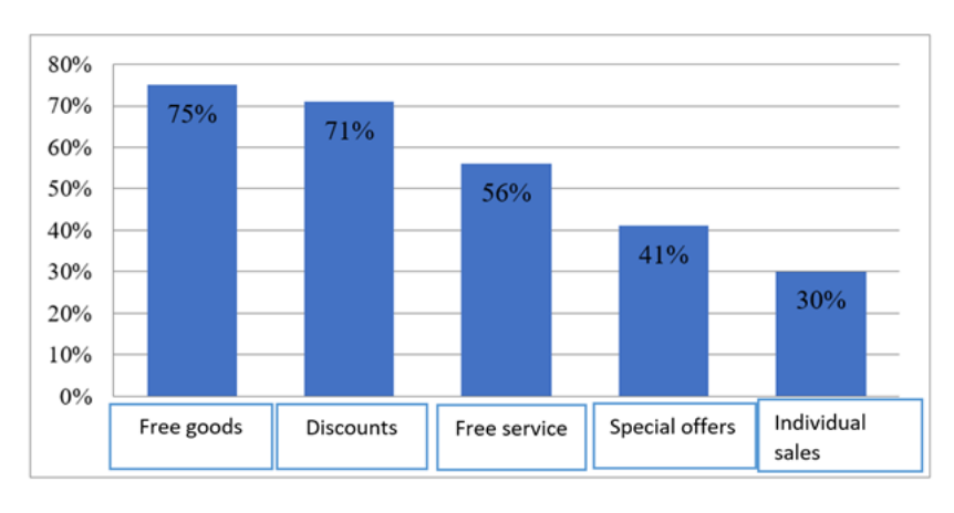
Fig. 1. Rewards preferred by customers

According to the annual survey on the attitude of consumers to loyalty programs Loyalty Barometer Report - 35% of consumers of hotel services show a desire to receive additional options, as well as to use advanced tools to search for the necessary goods or services. The main incentives for consumers to participate in incentive programs have been and remain free goods/services and discounts. Therefore, managers should not abandon these formats of providing prizes and discounts when creating incentive programs, as they can help strengthen relationships with consumers, these incentives act for clients as an indicator that the organization appreciates them, but it should be borne in mind that free gifts cannot completely replace permanent bonuses or discounts.